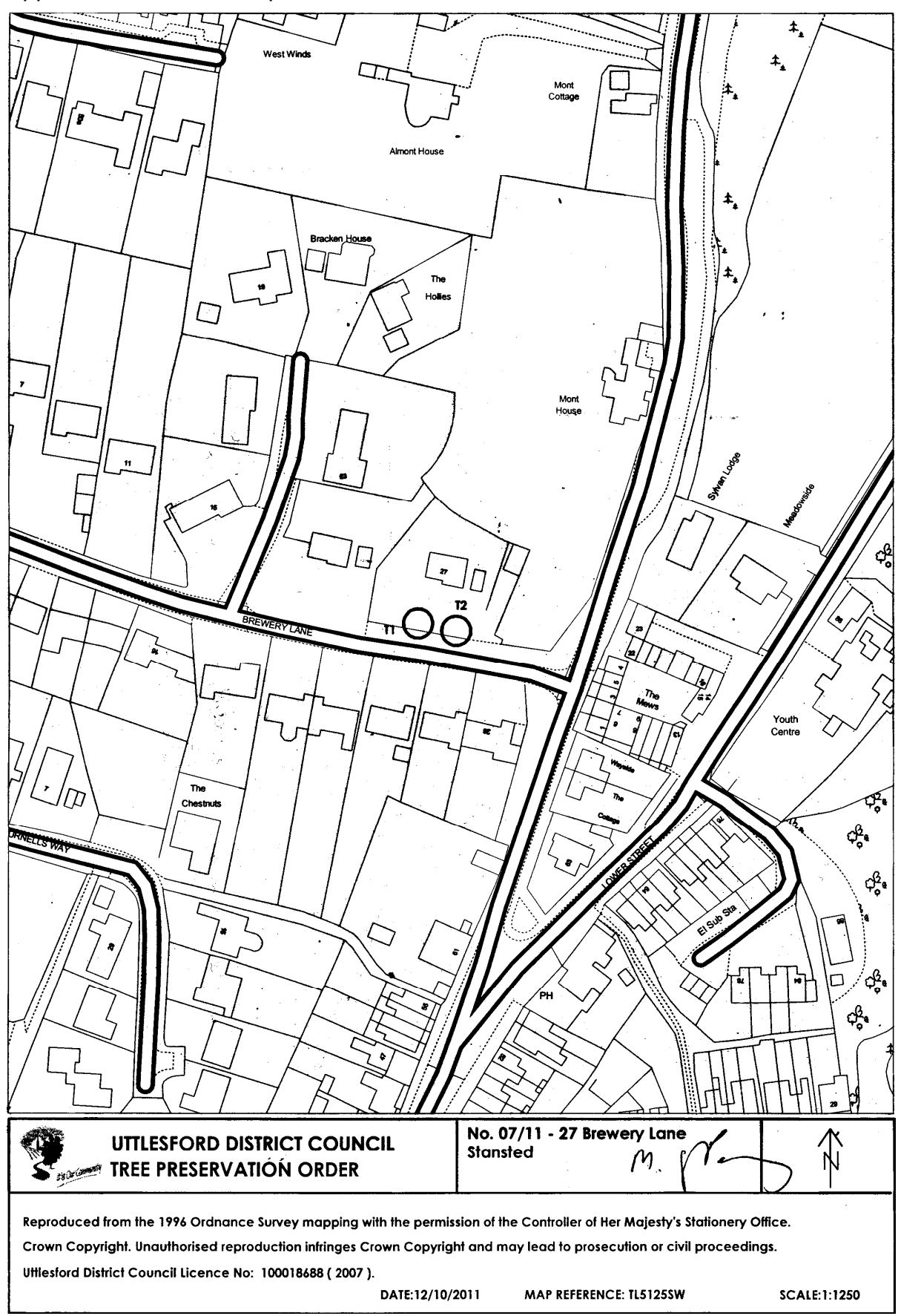
Appendix 1: Location Map